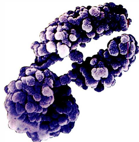
Chromosomes measuring on the order of 10^{-6} m across as seen in a scanning electron microscope.